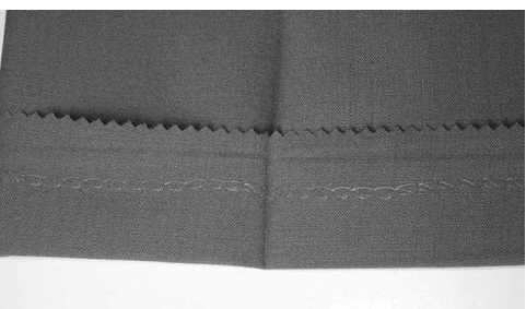
3) Pinked Hemline on Pants

To truly prevent raveling, add a row of straight stitching just shy of the pinked edge (2). Pinking alone works better for items that will be dry-cleaned. Often menswear pants have a pinked hem (3).