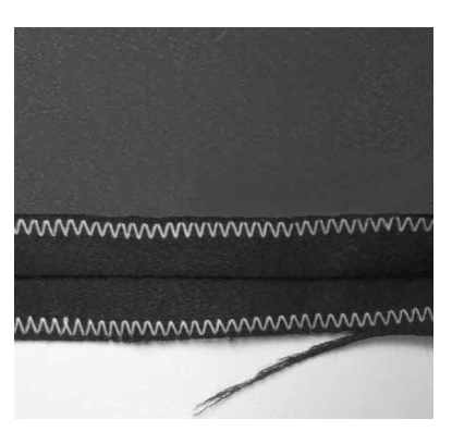
6) Zigzag near edge; trim close to stitching.

Set your machine for a short, medium-wide zigzag stitch. Stitch close to—but not over—the fabric edge. Trim the fabric edge close to the stitching if necessary (6). If the fabric has a lot of body or is stiff, you can let the right-hand swing of the needle stitch over the edge.