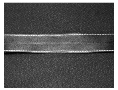
4) Clean-Finished Seam

This is a beautiful finish, especially on fine fabrics, that requires no special equipment. It's suitable for the inside of an unlined jacket as well as most any garment as long as the doubled fabric won't add bulk to the seam (4).