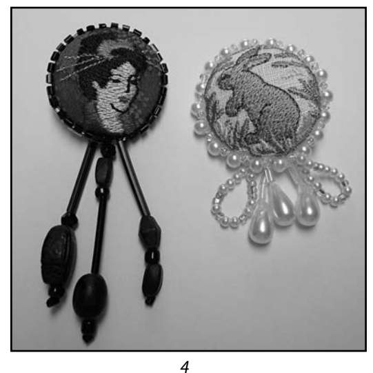
"A Bit of Stitch" embroidery design