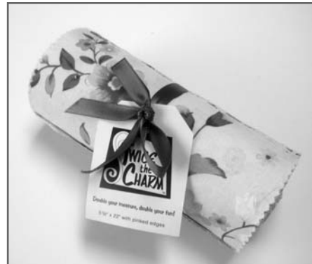
Twice the Charm