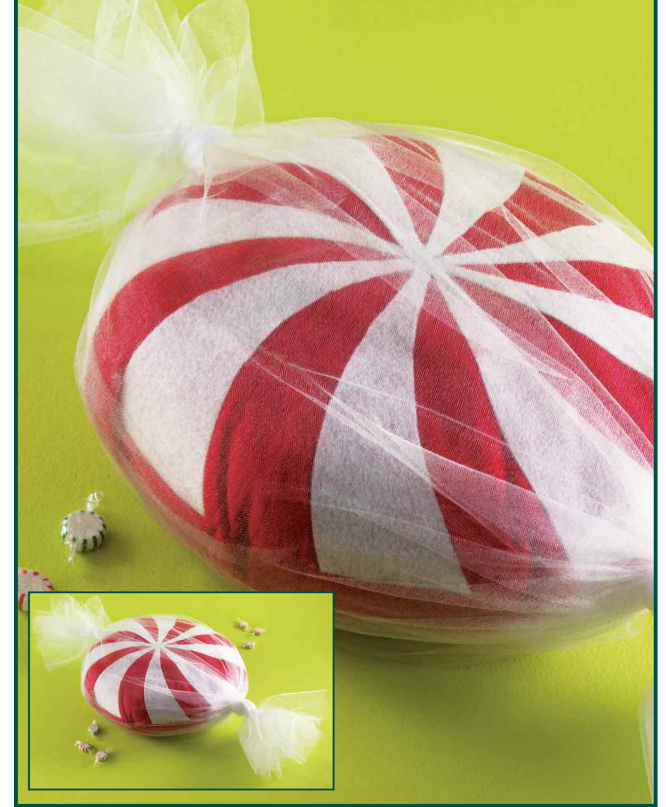
more projects available at Joann.com

Project courtesy of Jo-Ann Fabric & Craft Stores