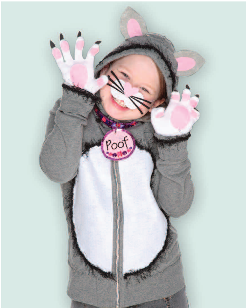
no-sew cat's meow costume