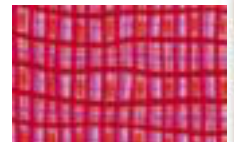
92024 (R) Red 1/2 yd