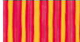
92027 (SO) Yellow/Orange 1/3 yd