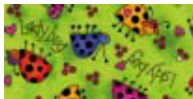
92022 (G) Green 1/4 yd