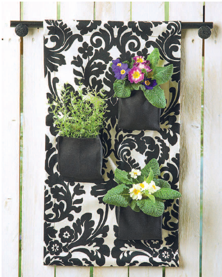
hanging flower pots